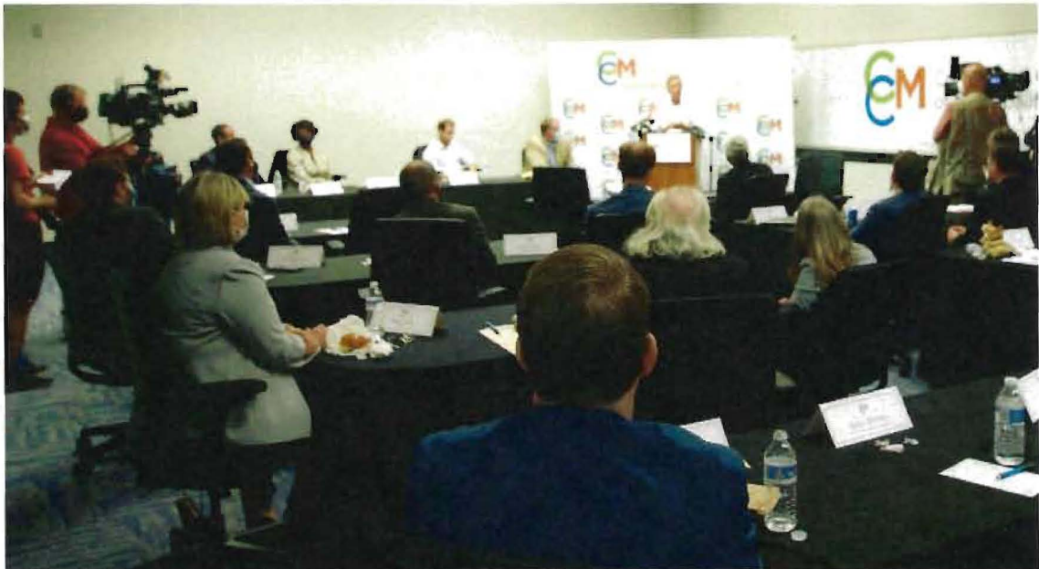
Governor Lamont spoke at the ARP Advisory committee's recent meeting held at CCM's offices in New Haven

This toolkit is intended to be a resource and supplement formal information provided by federal and state government agencies. CCM encourages local officials to continue to refer to the Interim Rule issued by the Department of Treasury for formal guidance.