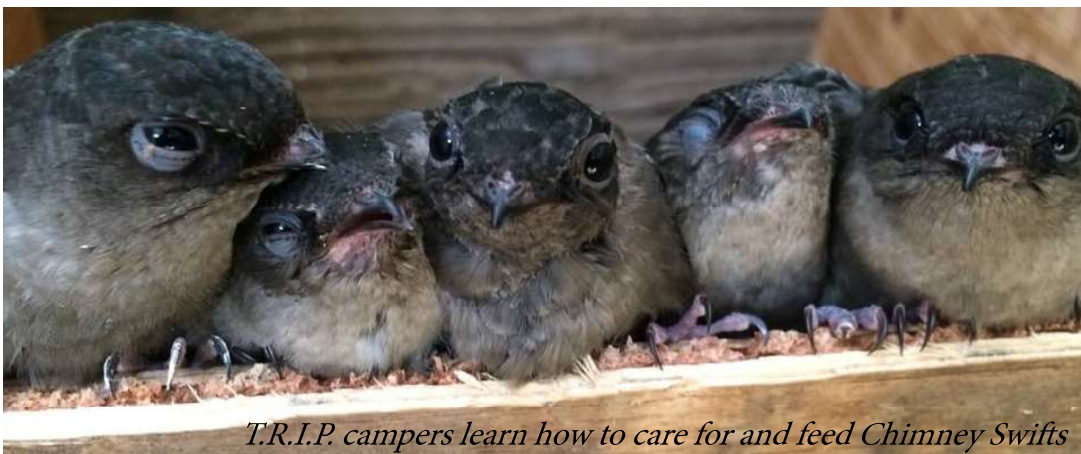
T.R.I.P. campers learn how to care for and feed Chimney Swifts

injured wildlife, animal ID, handling and restraint, physical exams, common diseases and parasites, diet preparation, baby bird hand feeding basics, and conservation initiatives connected to our wildlife rehabilitation work. This “camp” is more like a course, with presentations and instruction, along with hands-on practice on both deceased and live specimens. Participants will undergo some work in the wildlife rehab clinic under the supervision of the center’s Wildlife Rehabilitation Intern caring for injured animals, feeding baby birds, and other rehab-related tasks. Enrollment is limited to 8 students. Participants must be responsible, willing to communicate with others in the group and work together on program activities, work quietly in a rehab clinic setting and abide by clinic rules. **Some labs will involve working with deceased specimens.